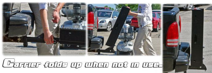
Carrier folds up when not in use.